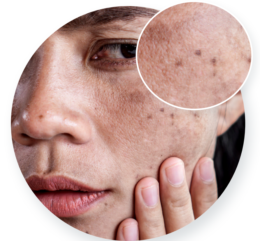
Mild to severe dark spots