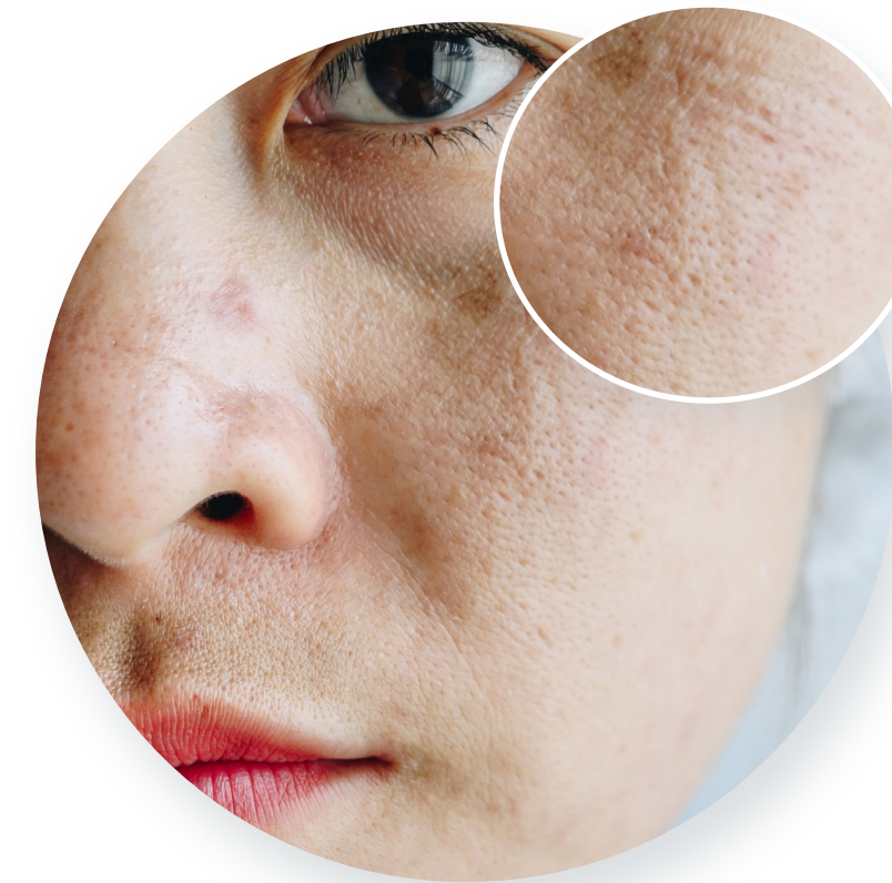
Mild to moderate textural irregularities

A buildup of dead skin cells, dirt, and chemicals on the face over time paired with pollution and sun exposure can exacerbate textural irregularities. 13