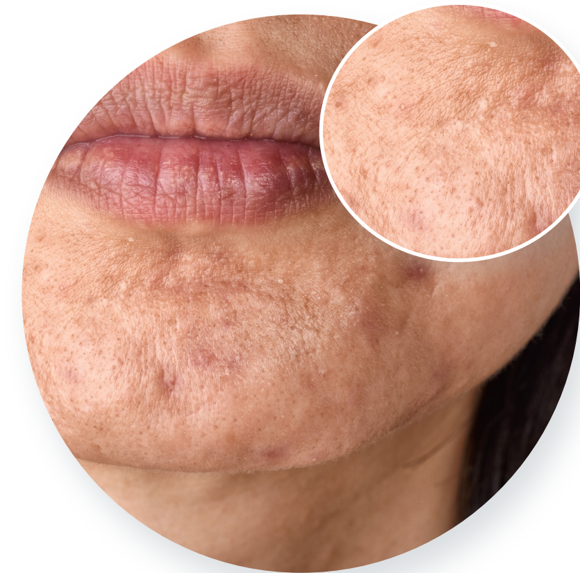
Mild to moderate dark spots

➔ Dark spots are very common and a natural part of aging but are increased with sun exposure. 10